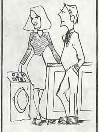
'It seems to have an insatiable appetite for single socks!"